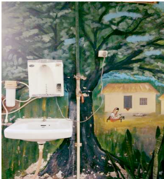
A new water filter has been installed for patients.

Shakyamuni Buddha Community Health Care Clinic (SBCHCC) continues to provide a wide range of medical and rehabilitative services and health educational activities into the year 2017. The centre currently operates six days a week with a full-time employed team of doctors, nurses, physiotherapists and other support staff. Along with these, there are visiting doctors. The services are provided through our homeopathic outpatient clinic. The centre has well equipped both allopathic and homeopathic pharmacies that distribute free medication to the patients.