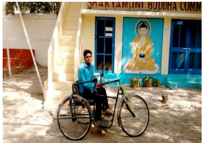
We have facilitated donation of a commuting vehicle for a differently abled person.