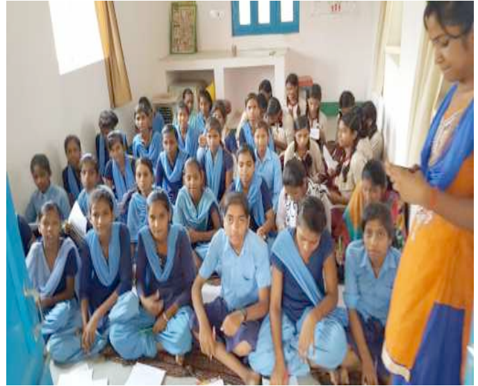
Adolescent girls education program