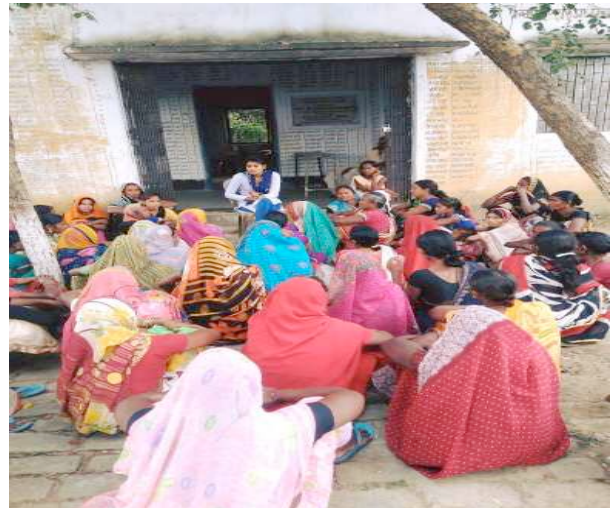
Health education at our centre and in the villages.